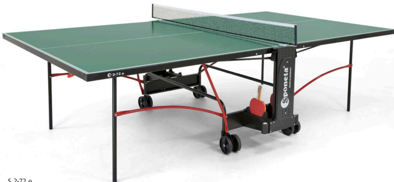
S 2-72 e