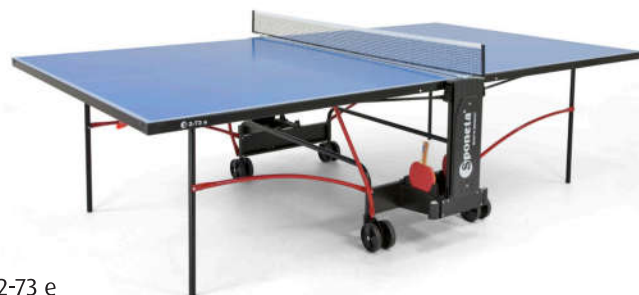
S 2-73 e

1) for outdoor melamine resin boards according to our warranty terms